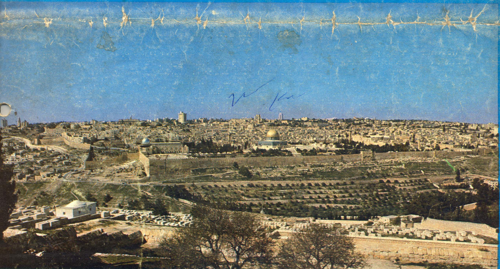
Jerusalem — general view from the Mount of Olives. Looking across the Kidron Valley you can see the walls of the Old City. The building with the golden dome is the Mosque of Omar, standing where the ancient Temple stood. In the left background is Mount Zion.

I s r a e l S P O T N e w s / f o r e c a s t M o n t h l y