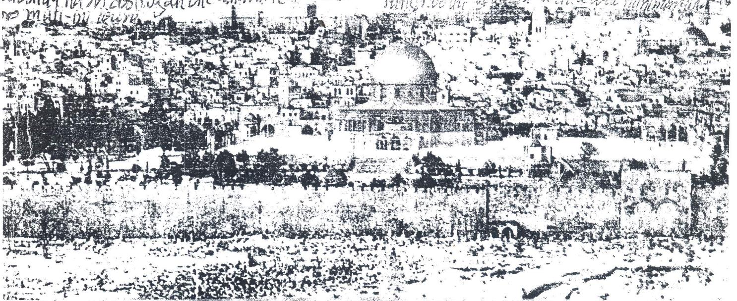
portion of the Old City of Jerusalem. Over half lies to your right not in view. The Mohammedan Mosque of Omar, standing where the Holy Temple once stood, is conspicuous before you. Looking over the Old City you can see King David Hotel, with the tower of the Y.M.C.A. showing above it, and ... (See explanation on p. 2)

page 6 - ... yah ... yah ... yah page 7 - ... yah ... yah ... yah page 8 - ... yah ... yah ... yah