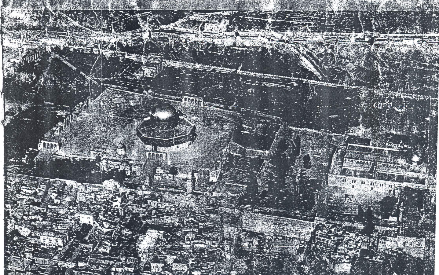
Jerusalem. The Old City from the air. From here He commanded blessings, even life forevermore. He hath chosen ZI He hath desired it for His habitation. "Here will I dwell". — Psalms 132: 13, 14, and 133: 3.