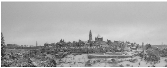
Jerusalem covered in snow.

"Pray for the peace of Jerusalem: they shall prosper that love thee." Psalms 122:6