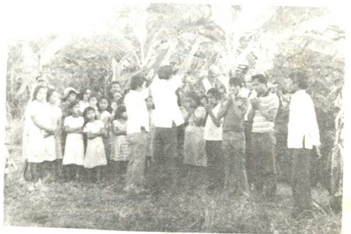
Baptismal service in Carmen, Bohol, Philippines.