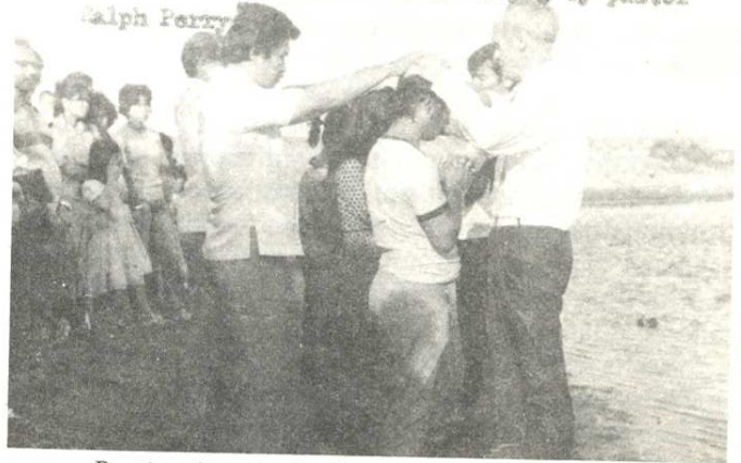
Baptismal service in Abuyog, Leyte, Philippines.