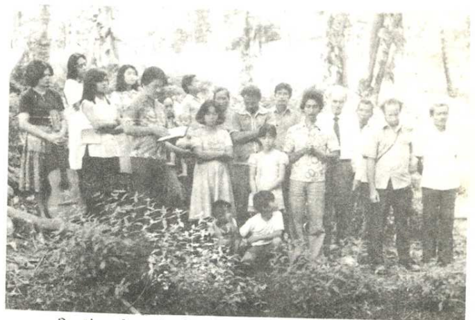
Baptismal service in Abuyog, Agusan, Philippines.