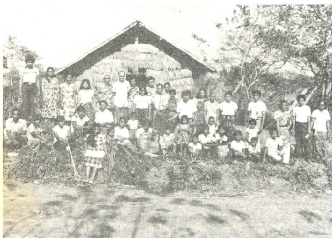
Congregation of The Church of God in Ipil, Zambozur, Philippines, standing in front of their newly finished chapel.