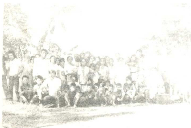
Baptismal service in Naval, Leyte, Philippines.