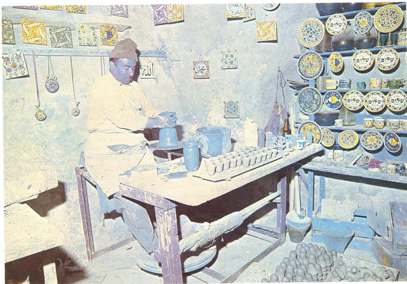
An Arab Potter at work — near Hebron

"If I forget thee, O Jerusalem, let my right hand forget her cunning If I do not remember thee, let my tongue cleave to the roof of my mouth, if I prefer not JERUSALEM above my chief joy." Psalms 137:5, 6