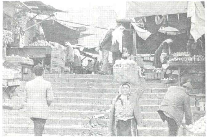
Old Bethlehem Market

The authority sent nightly patrols until it determined that the kibbutz did not implement the proposed safeguards.