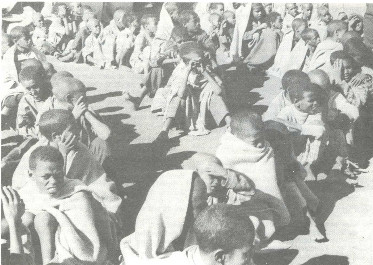
Starving Ethiopian children wait to be fed.