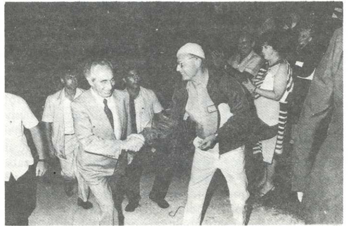
Prime Minister of Israel, Shimon Peres, greeting Christians at Feast of Tabernacles celebrations in Jerusalem.

A Sukkah consists of, at least, three walls — usually just wooden supports with blankets or sackcloth draped around them. The roof of leaves and palm branches is adequate shade from the sun in the day time, and, at evening, affords a sparkling view of the night sky for those who vote to sleep in their Sukkah. The Feast of Tabernacles is a popular holiday in Israel.