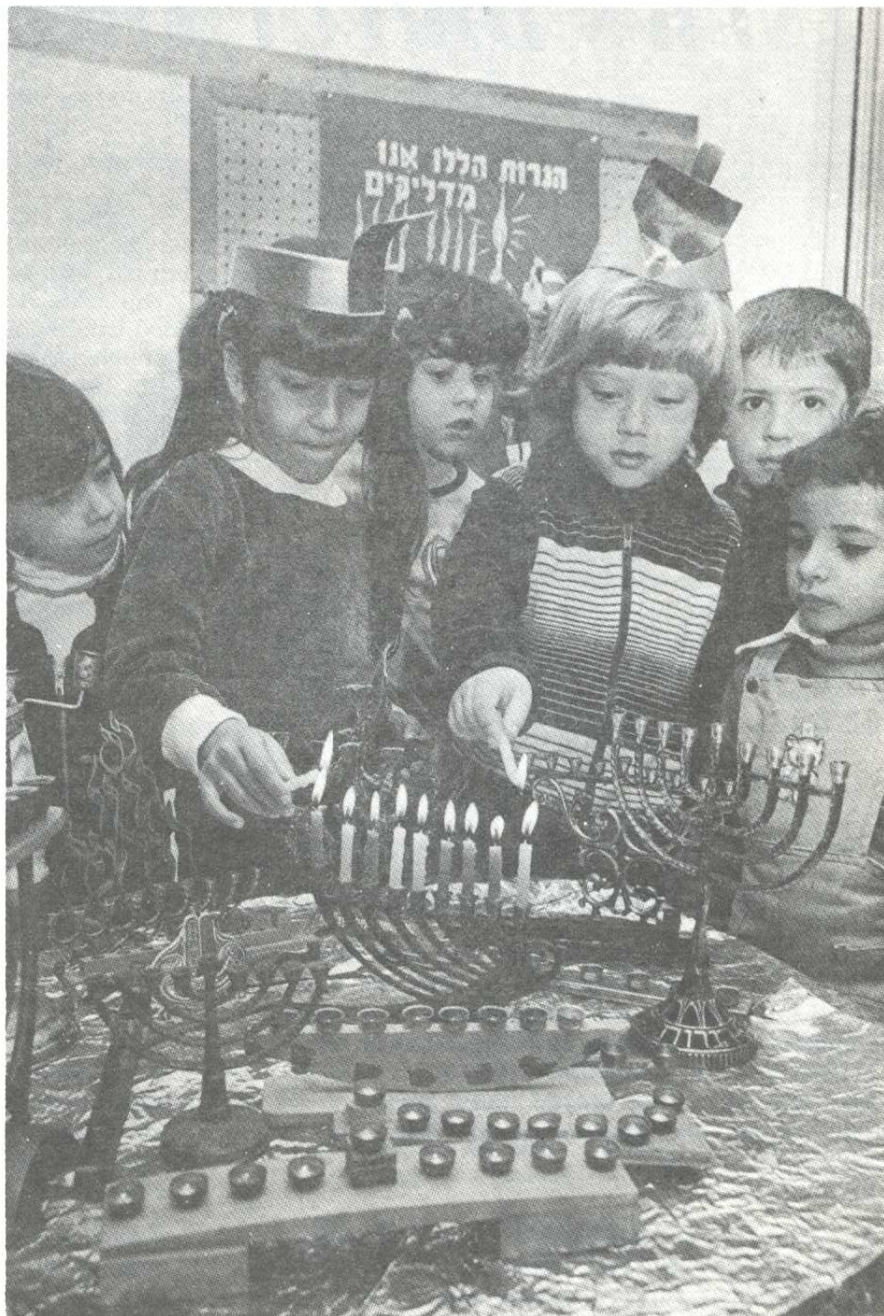
Children lighting a Hanukka lamp.