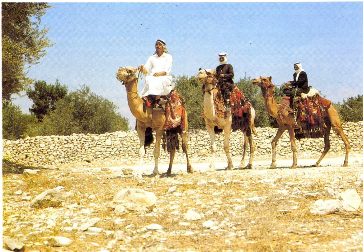
Arab Bedouin with their camels. You still see quite a few camels in Israel (of the one-hump variety) especially in the desert areas of the country where the bedouin live.

"If I forget thee, O Jerusalem, let my right hand forget her cunning. If I do not remember thee, let my tongue cleave to the roof of my mouth, if I prefer not JERUSALEM above my chief joy." Psalms 137:5, 6.