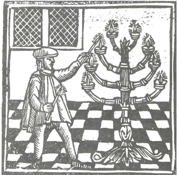
17th century woodcut — The lighting of a Hanukka lamp in a synagogue.

Well, that's the story of Hanukka. It started out as a Temple observance, one that was conducted only in the Temple once a year to commemorate the rededication of the altar (see John 10:22), and, in time, it spread to become a popular family holiday. In some countries the Jews treat it as a sort of counterpart to Christmas.