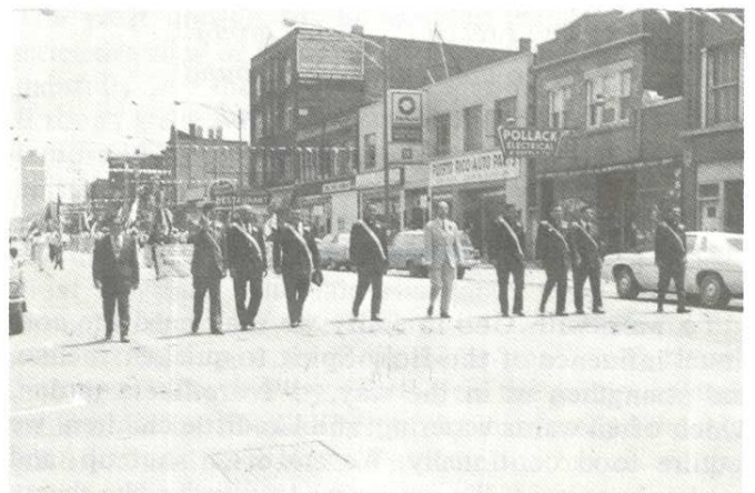
Pastors and Ministers of the International Ministry of The Church of God leading the annual Evangelical Youth Parade in Chicago, Illinois, U.S.A.