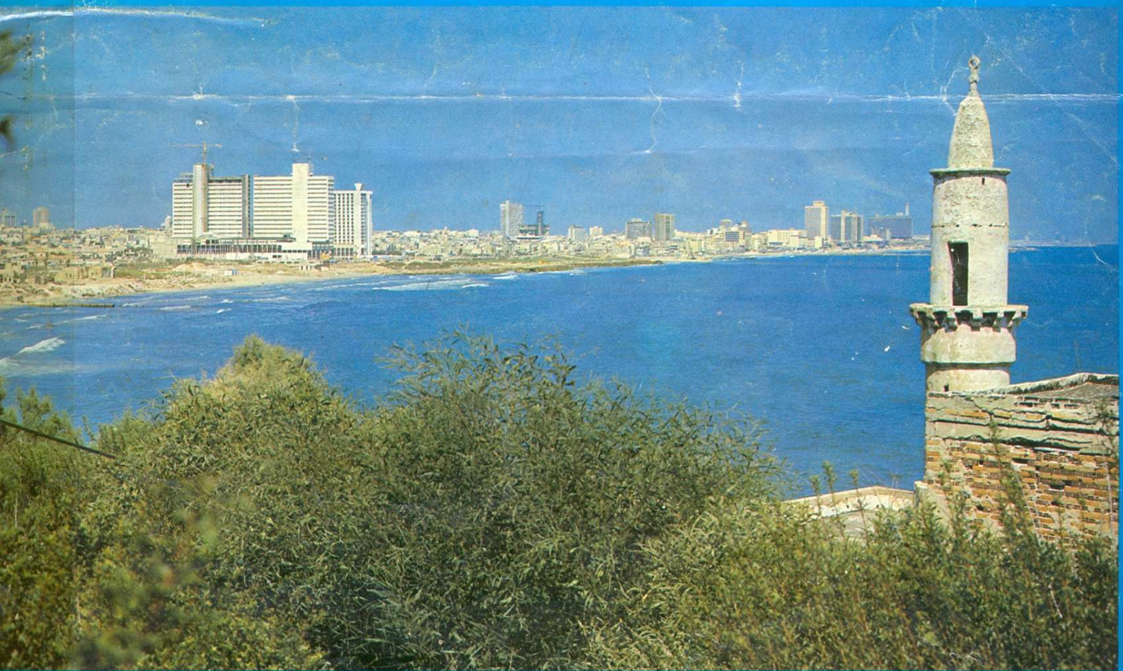
View of Tel-Aviv from Jaffa (Biblical Joppa).