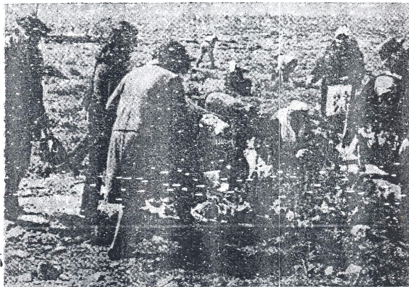
Elderly persons from Jerusalem planting trees on the slopes of Nebi Samwil, under the auspices of the Jerusalem Municipality and the J.N.F. In the background is the village of Beit Iksa.