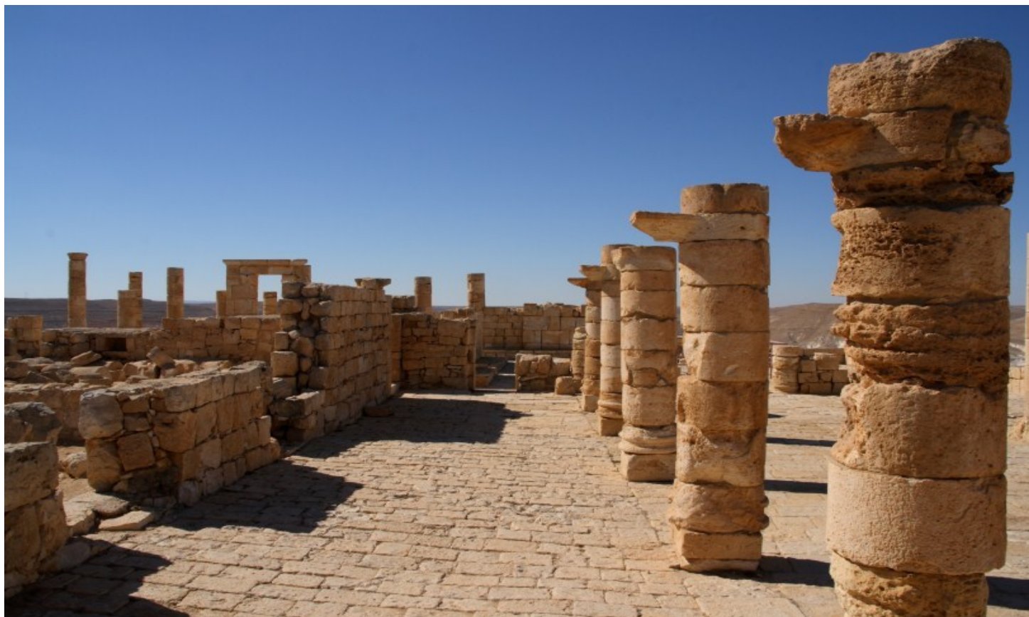
Avdat, The Negev: Period The Nabataean religion was established around the 3 rd century B.C.