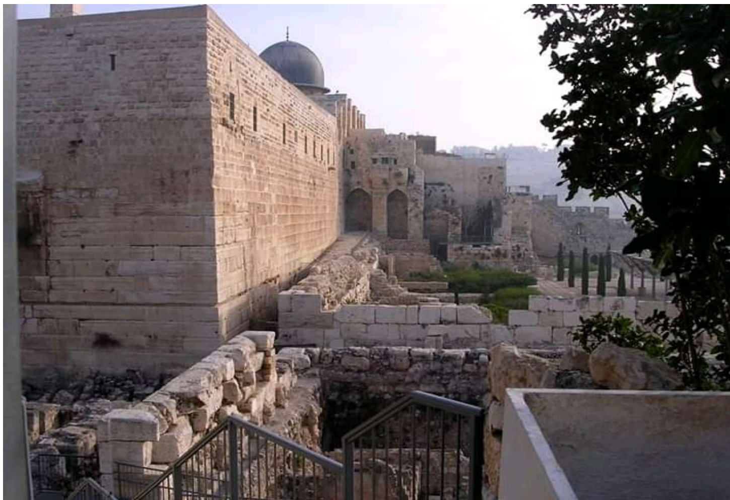
The Old Jerusalem city wall.