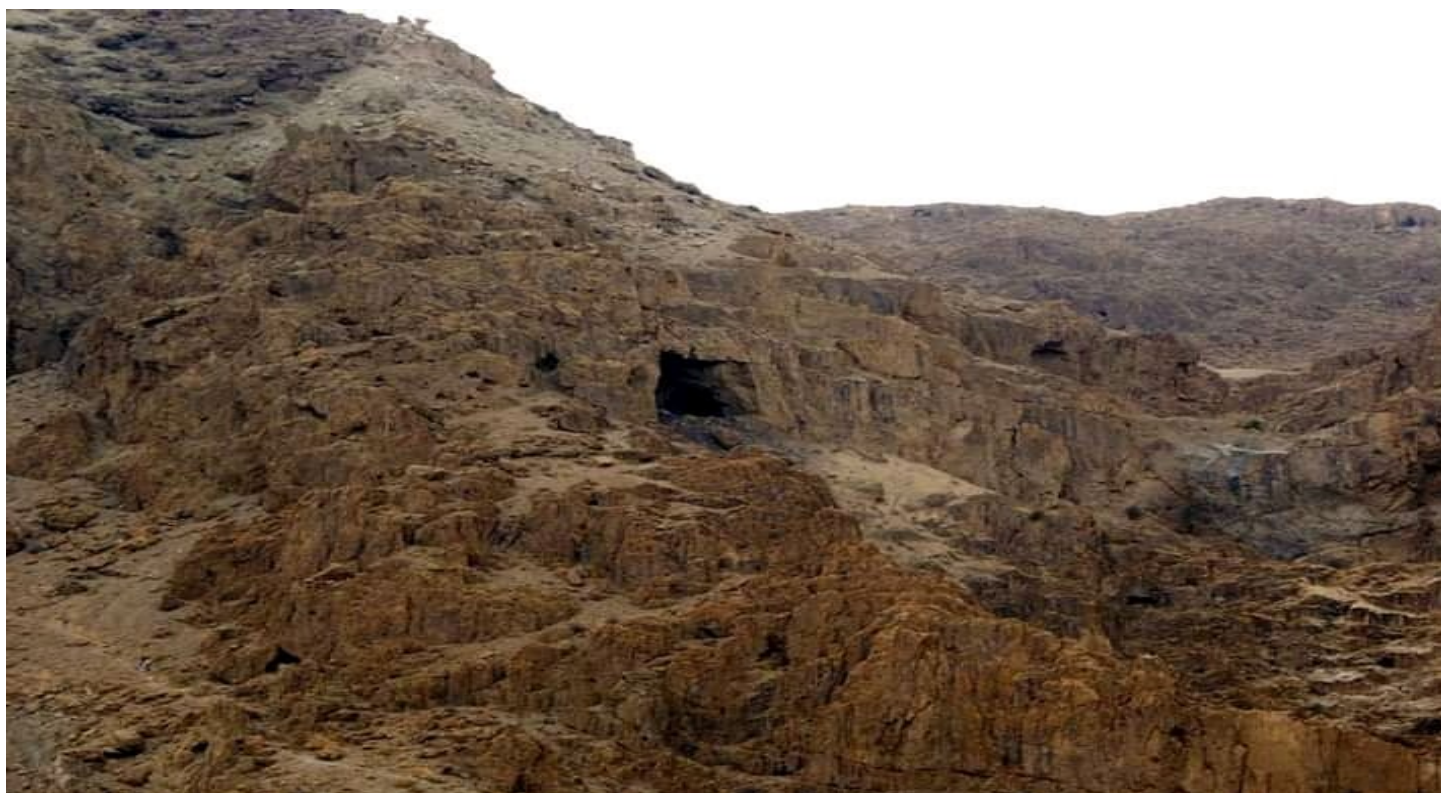
Qumran, Caves where the Dead Sea Scrolls were found.