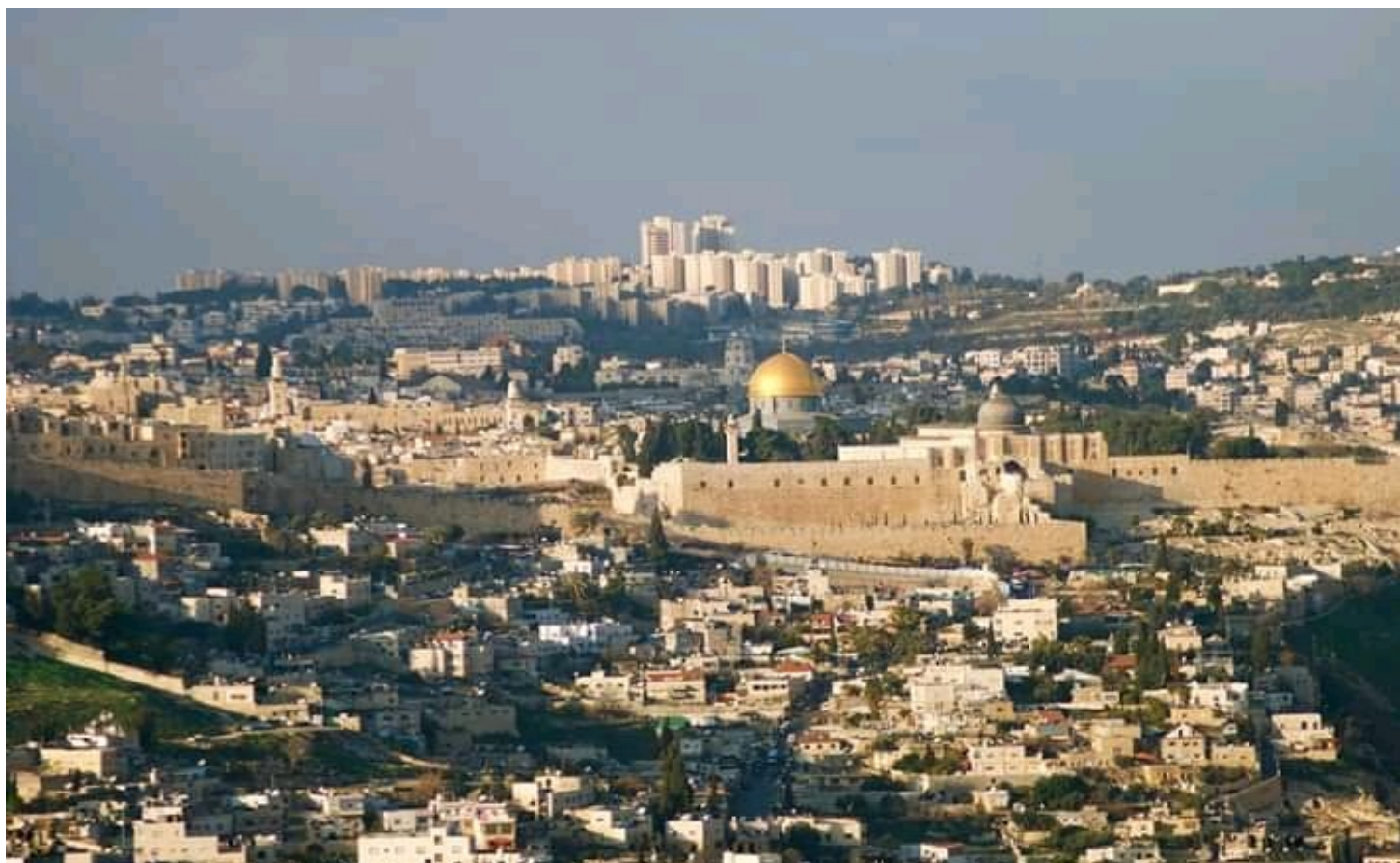
Overlooking Jerusalem from Mountain Scopus.