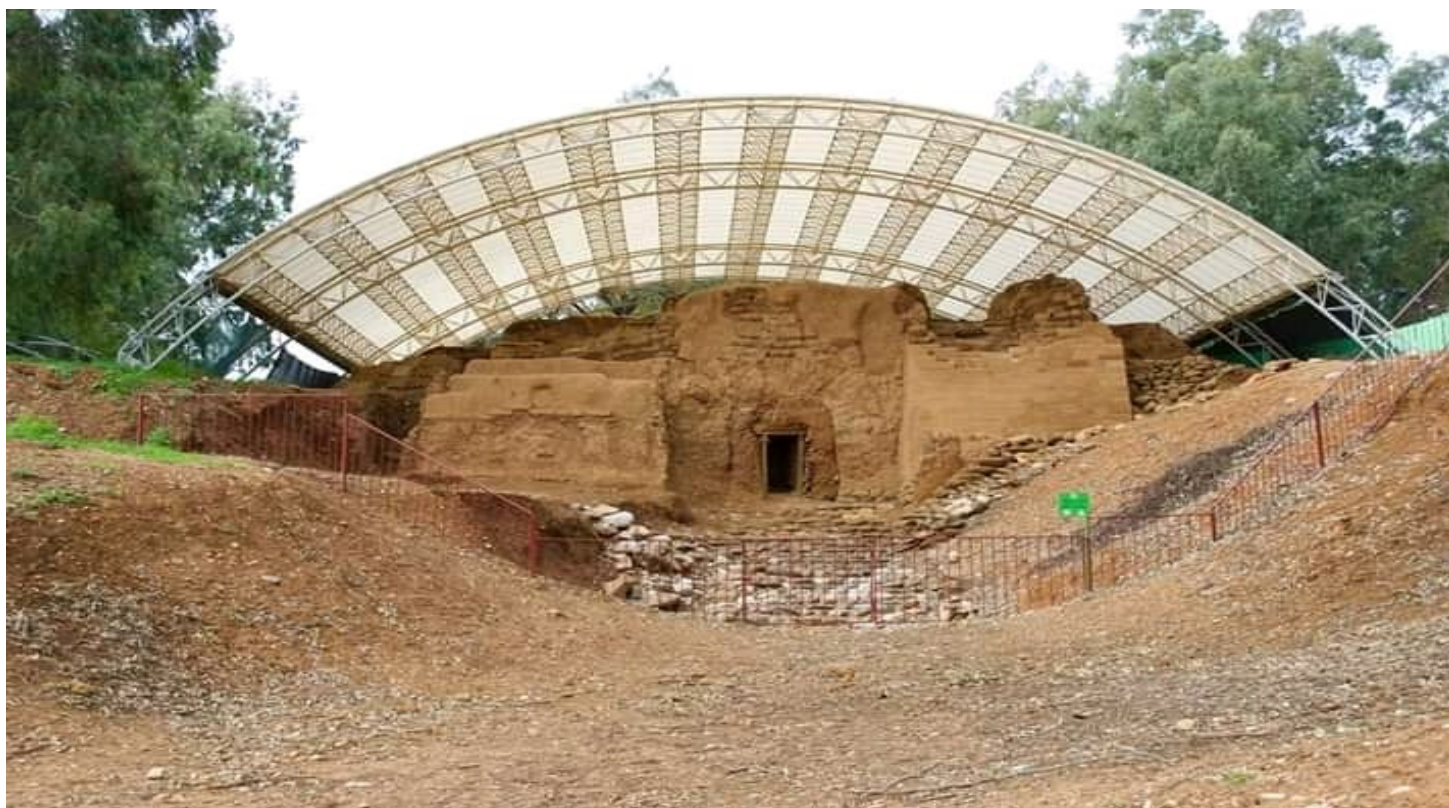
Abraham's gate at Tel Dan.