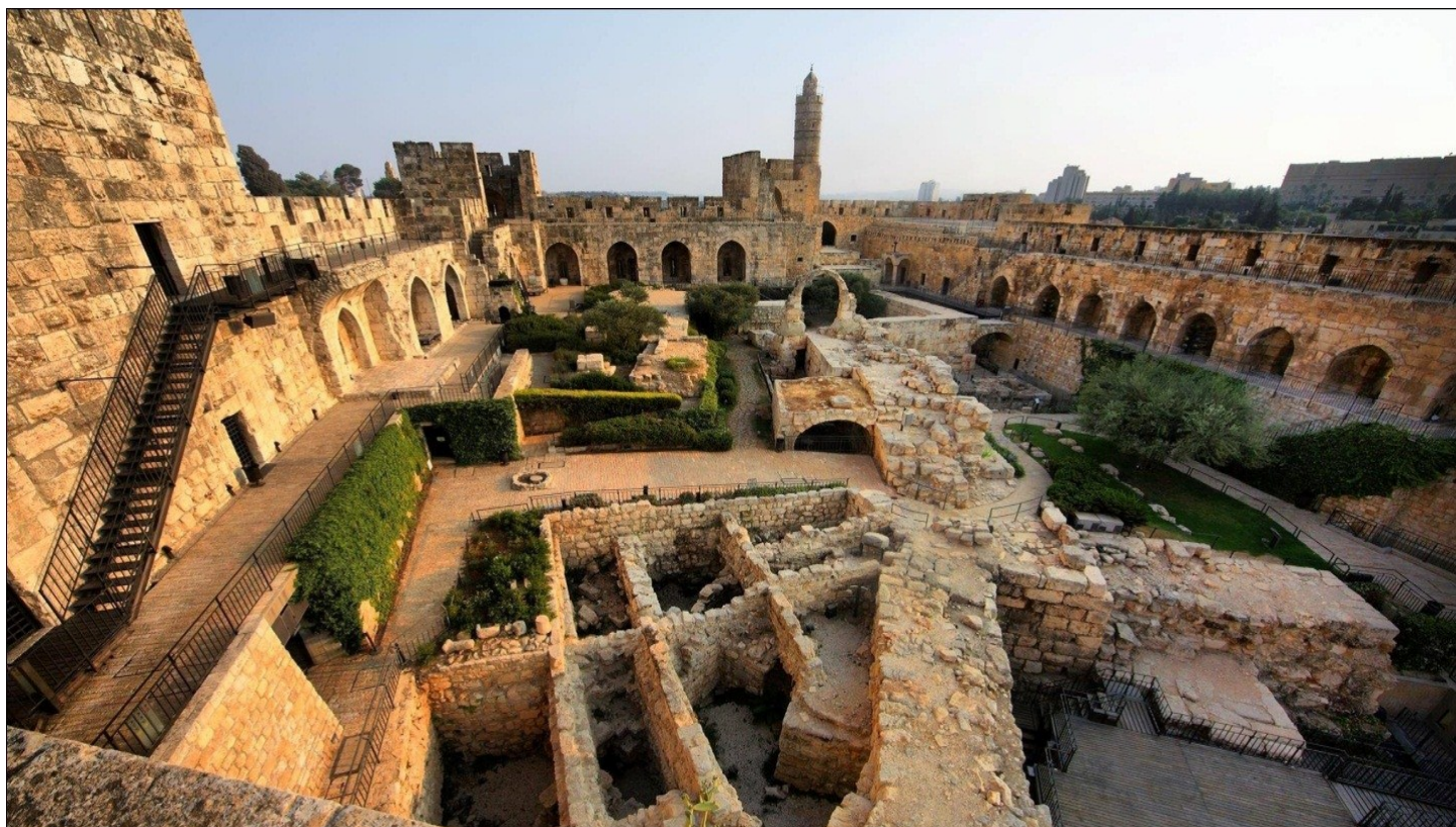
City of David/Hezekiah's tunnel – An ancient tunnel underneath the city of David in Jerusalem.