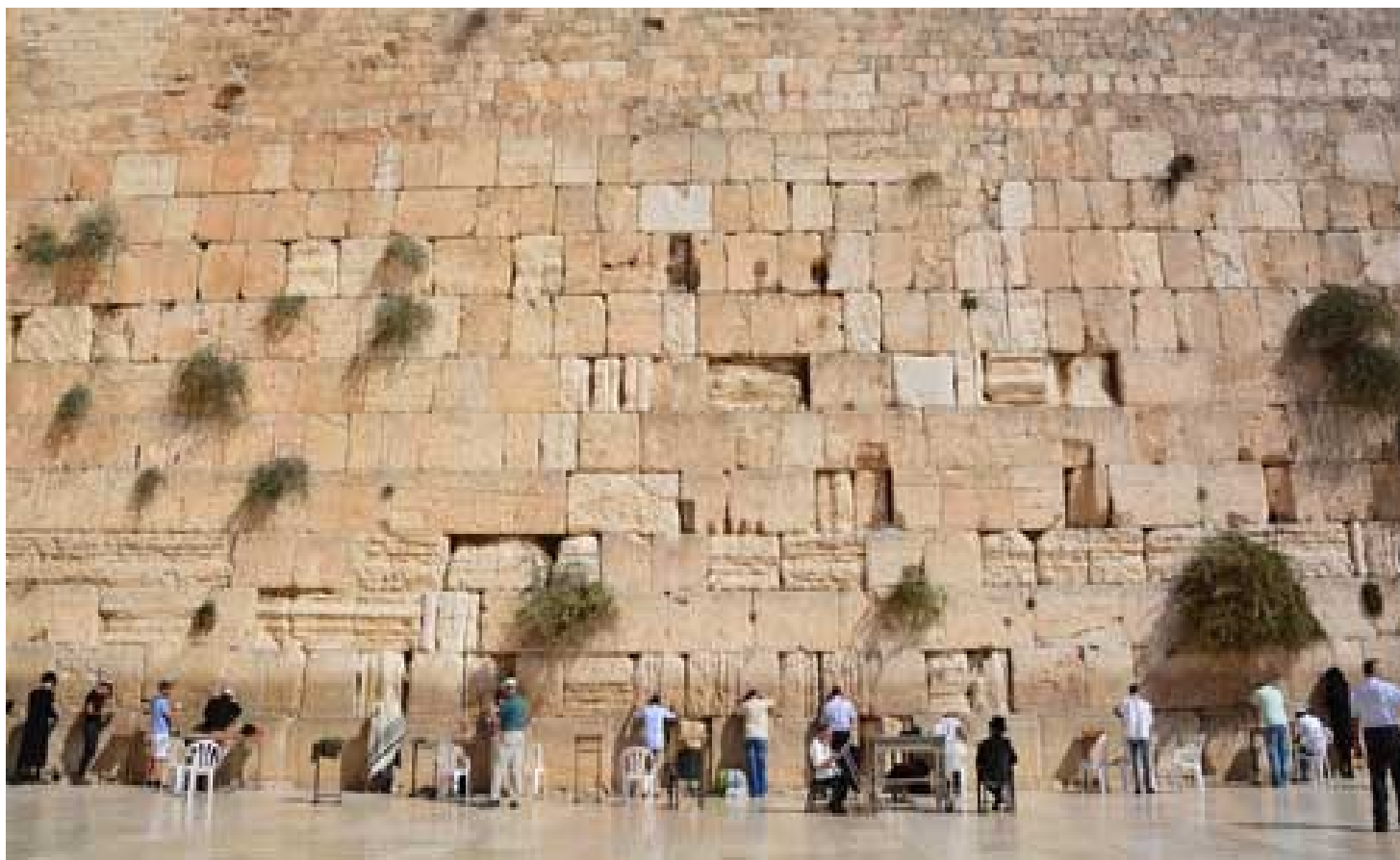
The Kotel – also known as wailing wall. It remains in the second Temple. Only wall Romans were unable to destroy.