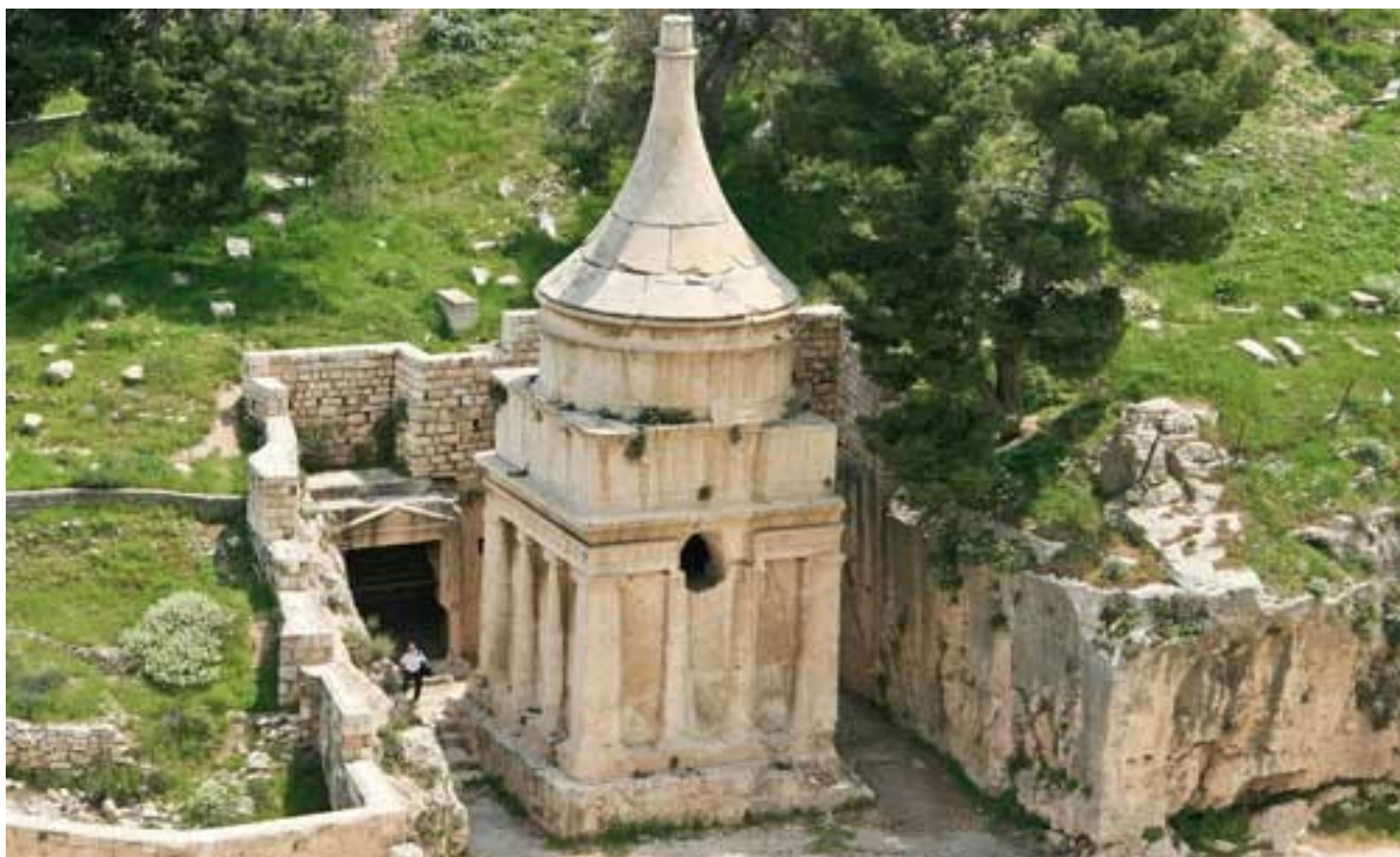
Tomb of Abshalom – also Yad Avshalom, the famous archaic pillar is tomb of Abshalom.