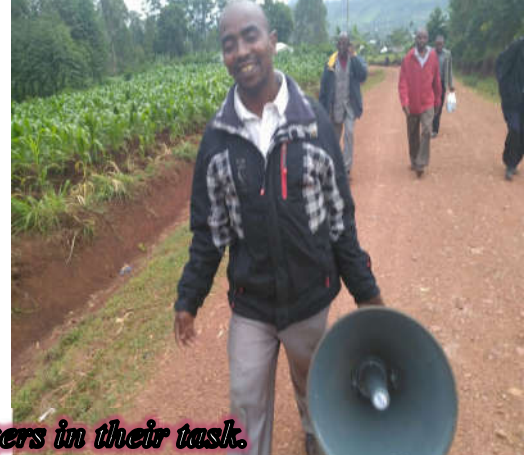
Leaving their homes and walking long distances and travelling far to take the message