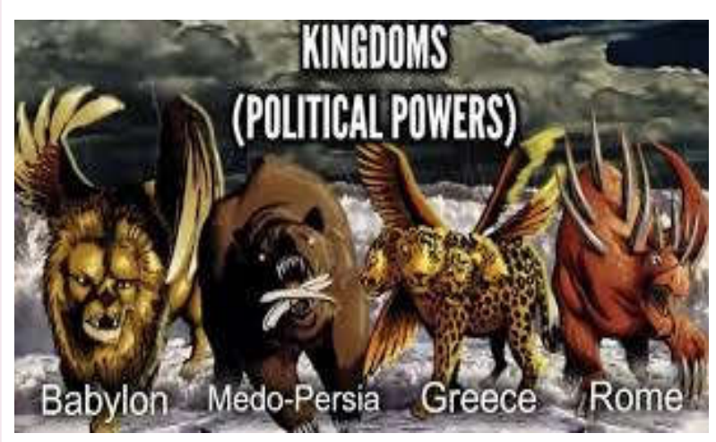
All people of the world, Messianites, Muslims, Hindu, Buddhists, Atheists or even pagans, they are all affected by these world kingdoms and therefore all need to have an insight about these 'beast' Daniel 2.

Now if you convert the name "Vicarius Filii Dei" into Roman numerals, and add them up, you will come to 666. This is the number of the beast and more specifically, the number of <u>A MAN!</u>