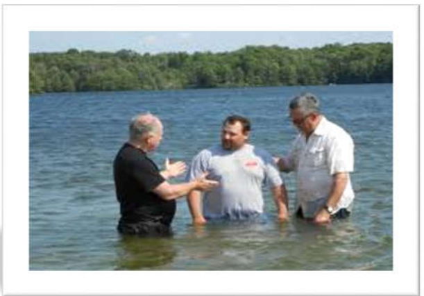
If people repent baptize them by immersion in the name of Yahshua.

Although helpful, mere knowledge of the beast's identity will not guarantee escape. Judas knew Yahshua as the Messiah, yet he betrayed Him. Similarly, many of those who understand last-day prophecies will ultimately find themselves on the side of the beast. Knowledge definitely isn't enough.