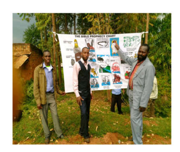
Taking a break after a successful outreach mission in Kisii 2016. These men are out to convey the message of salvation to all people of the world.