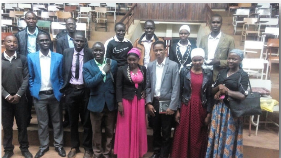
Members of Messianic Students Association representing various Kenyan Universities at KU. The body seeks to unite all Messianic students under one umbrella.