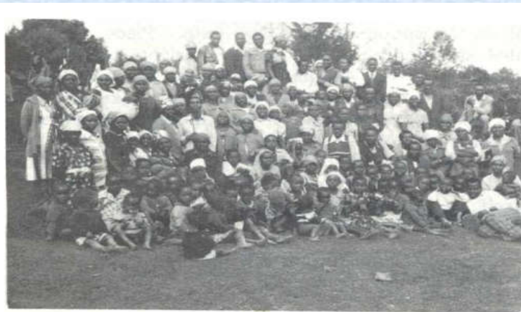
The Church of God 7th day, in Mbugiti, Kenya, East Africa. This photo was taken during The Feast of Tabernacle meetings.

Colossians 3: 15- 17 And let the peace of Elohim rule in your