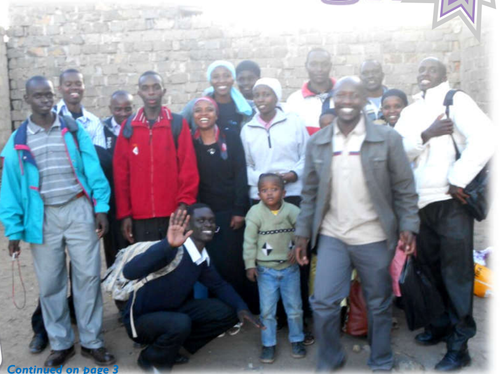
Continued on page 3

Everybody desires peace and tranquility in his/her life; unfortunately the world cannot offer the same in its current state. The world without the living beings cannot be lively. The main reason behind Elohim