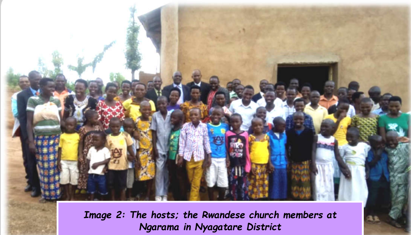
Image 2: The hosts; the Rwandese church members at Ngarama in Nyagatare District

not answer to the call immediately as at the time the church had commitments in other Countries in the African Mission field.