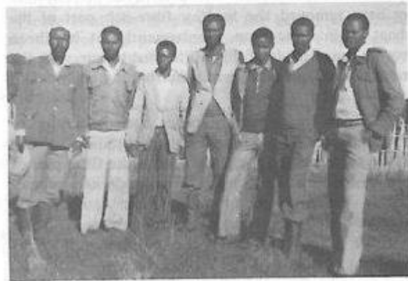
Elders and Deacons of The Church of God in Tiloa Farm, Molo, Kenya, East Africa.

The mandate of the committee was among others, collecting tithes and offering, visiting the sick, ensuring that 30% of the tithes supports local churches growth and assist elders in traveling where needed, and translation of pertinent books and tracts from English to local languages.