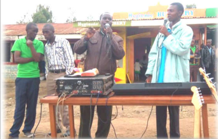
Both the young and the old