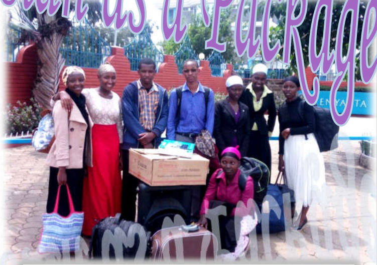
KU students leaving for Egerton

I thank Elohim for the grace he bestowed some of the students who availed themselves from the commencement of the open air meeting to the last day. This was in spite of their tight academic calendar. Since time was of essence, we decided to push ourselves to limit by having the message conveyed in the morning from 5 A.M to 8 A.M, followed by door-to-door engage-