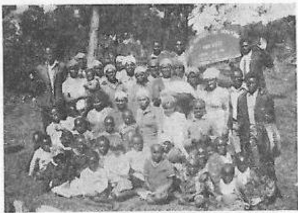
The Church of God group in Mbugiti, Kenya

(Continue reading.....from previous page)