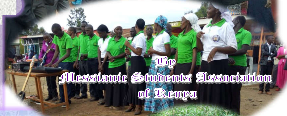
By Messianic Students Association of Kenya