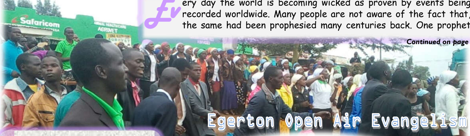
Egerton Open Air Evangelism