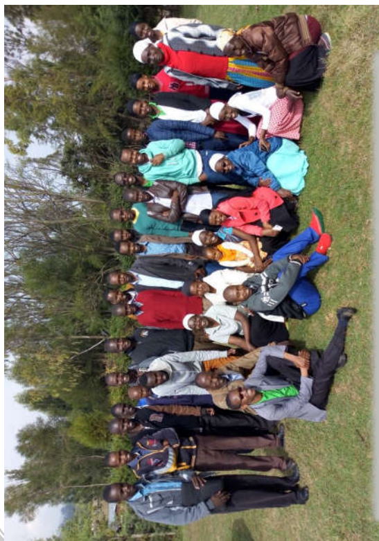
Just Before Departure after the Mission was concluded