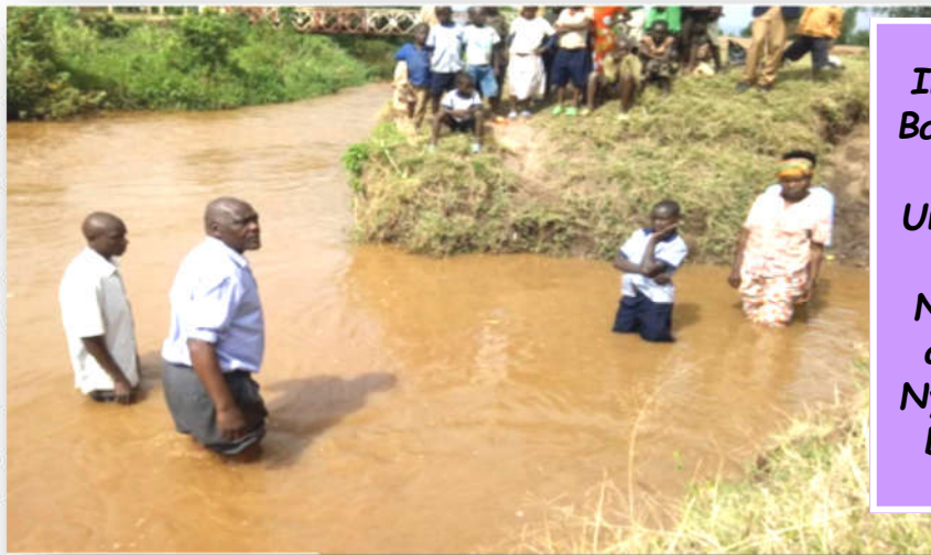
Image 3: Baptism at River Umuvumba in Ngarama area of Nyagatare District

The first trip in August 2017 was short but very successful. Four people were baptized and 16 children dedicated with the laying on of hands. A church was born in Ngarama in Nyagatare District and in Kigali City. Other local churches in Nyagatare District are: Cyabayaga, Bushara, Rukomo and Ndamu.