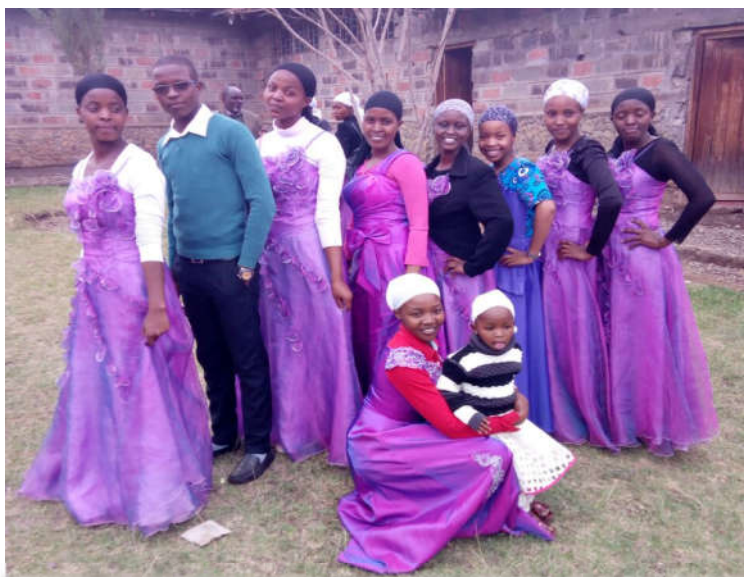
MUEU the hosts