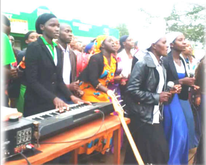
A joyful song to Elohim

ments. Later, we would hold an open air meeting from midday until night. The morning engagement was done from our host's house. The horn speakers were mounted outside the house then the messenger conveyed the message from within the house. The message was audible from quite a long distance. We even got immediate response, both positive and negative. The former response came from those people that felt the need of searching from the scriptures for more understanding on what was being conveyed. The latter came from the church leaders who felt intimidated by the message, since they do or did contrary to the Scriptures, and therefore feared for "their flock". As a matter of fact, someone was sent to us, to communicate that we needed to halt the preaching or he would take Legal actions.