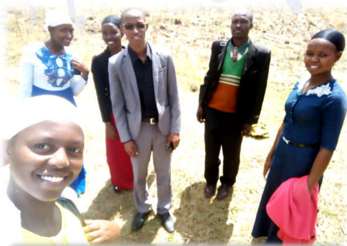
A typical Door-to-door Cell