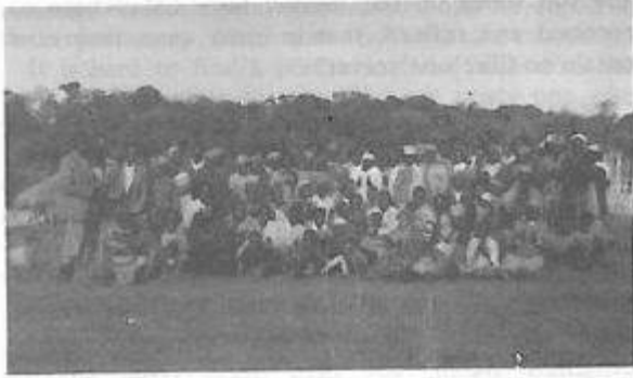
The Church of God 7th Day in Tiloa Farm, Molo, Kenya, East Africa.