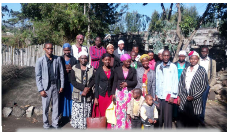
After a fruitful day: Among them. Belbur Messianic Brethren