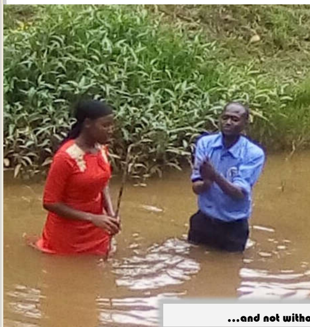
...and not without fruits: 3 of them...