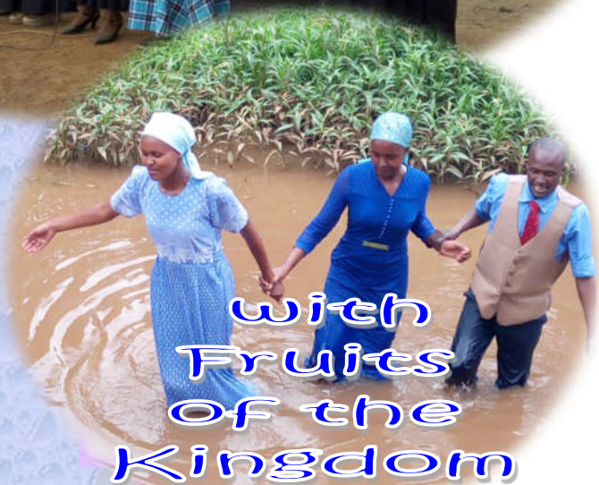
with Fruits of the Kingdom

It's 5 a.m. on a Sabbath morning, I wake up and prepare to visit a group of dedicated evangelists of the Church of God Sev-