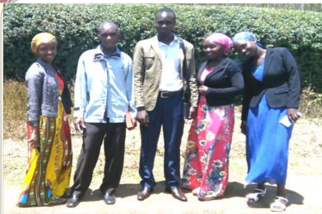
Another Door-to-door Cell