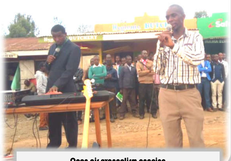
Open air evangelism ongoing