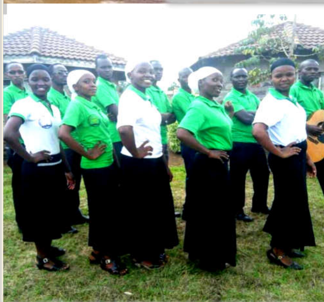
MSAK Officials : MSAK is the umbrella body