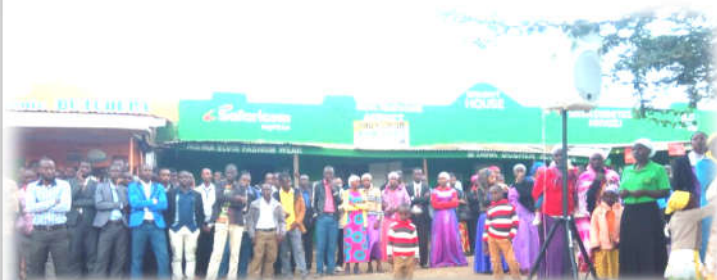
What an attentive audience