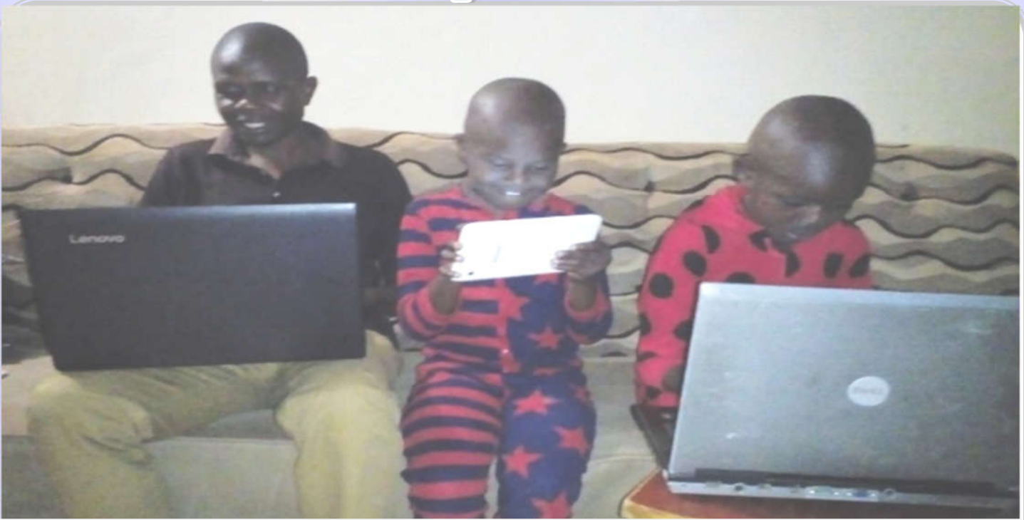
“.....each family member sitting in a corner of the room with a different gadget accessing different site”

filled understanding, knowledge and wisdom to a man named Bezaleel, this man was an expert in all manner of workmanship of gold, silver and brass and other stones. This knowledge came from Elohim and not from Bezaleel's carnal wisdom.