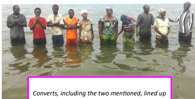
Converts, including the two mentioned, lined up for baptism in Lake Tanganyika.

While still in Burundi, and after three-day evangelism, many people believed the gospel and wanted baptism. As we were