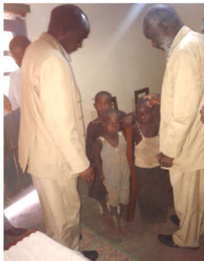
The sick young girl presented before the elders. The girl’s sickly leg being anointed with oil.