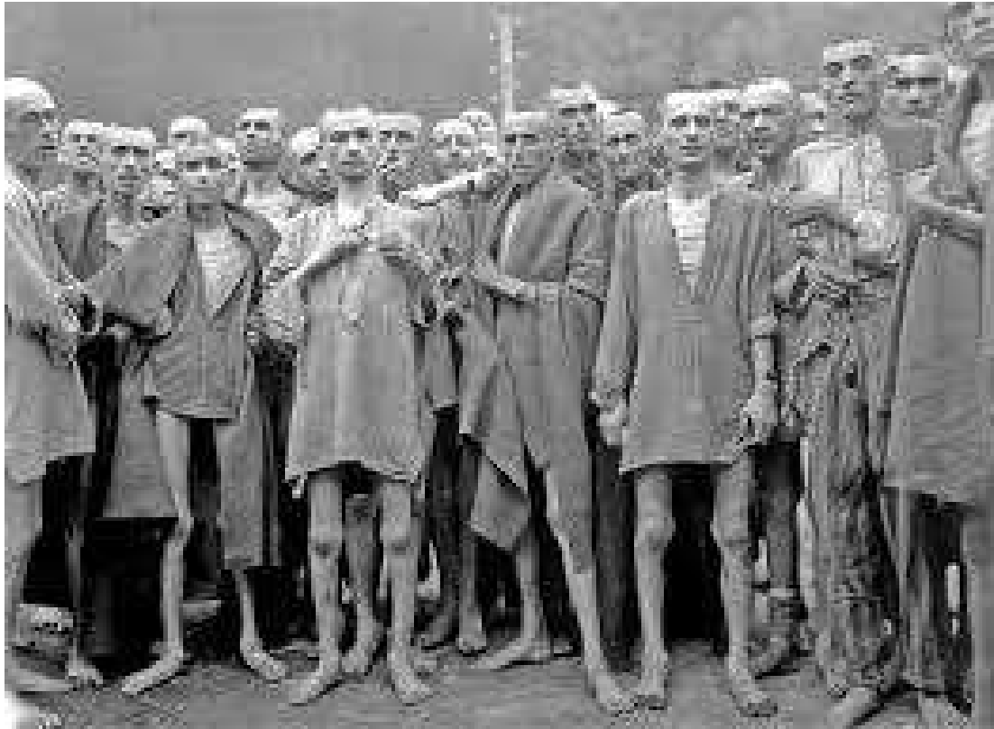
Male Holocaust Survivors.