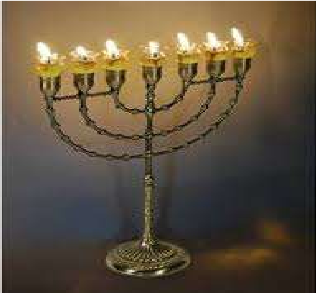
The Menorah, Golden Lampstand.