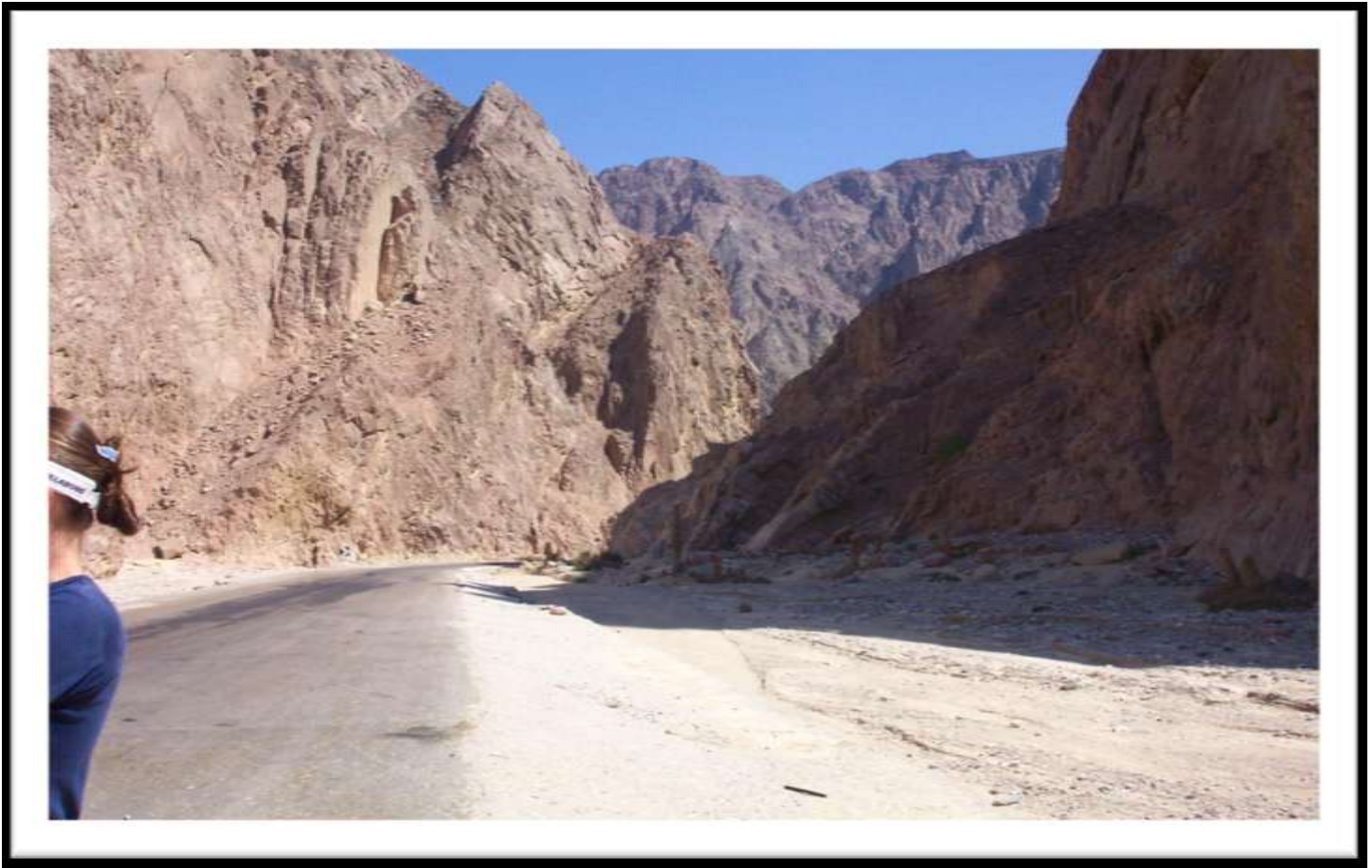
The highway, route of the Exodus for Israel in the day that he came up from the land of Egypt.