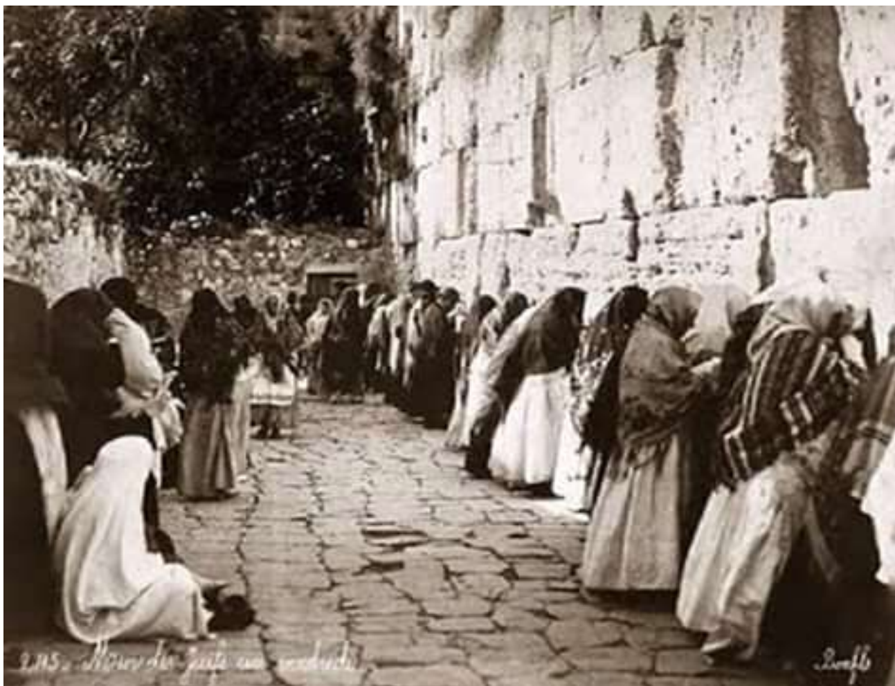
Women praying alone at the western wall in Jerusalem in 1899.