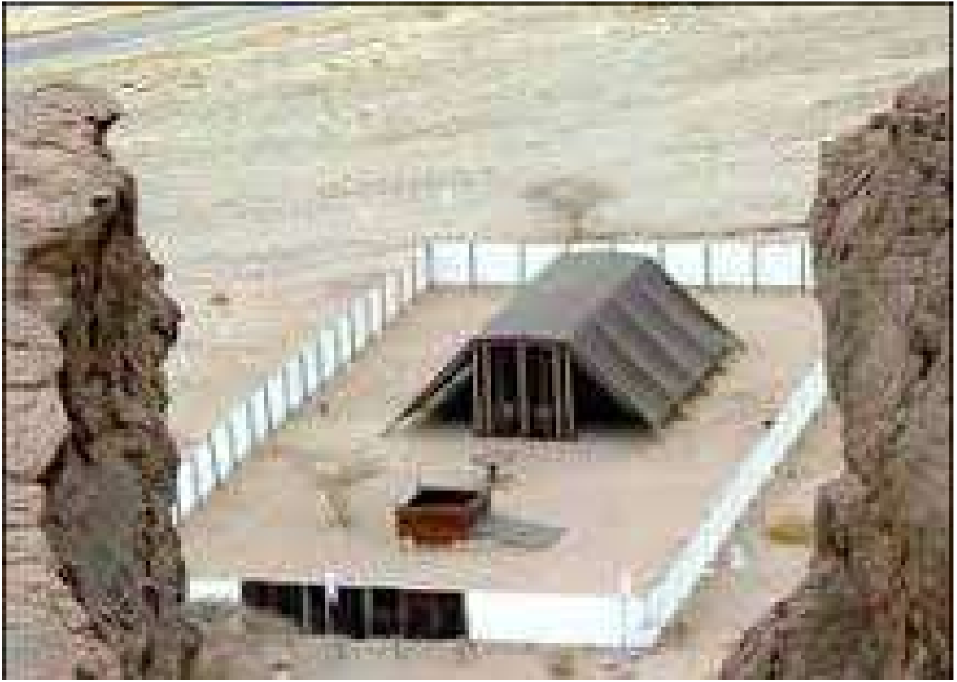
The tabernacle erected in wilderness.