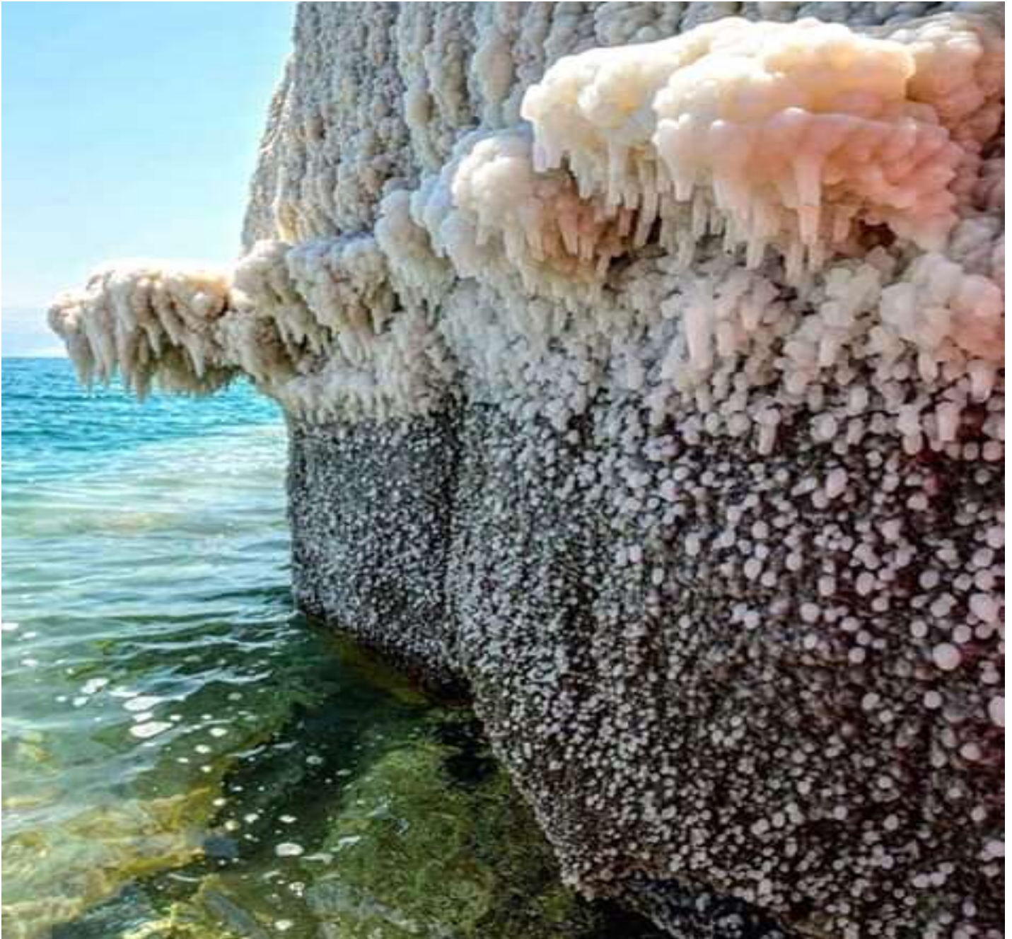
Dead sea, Israel

The Mount Zion Reporter P.O BOX 568, Jerusalem, Israel