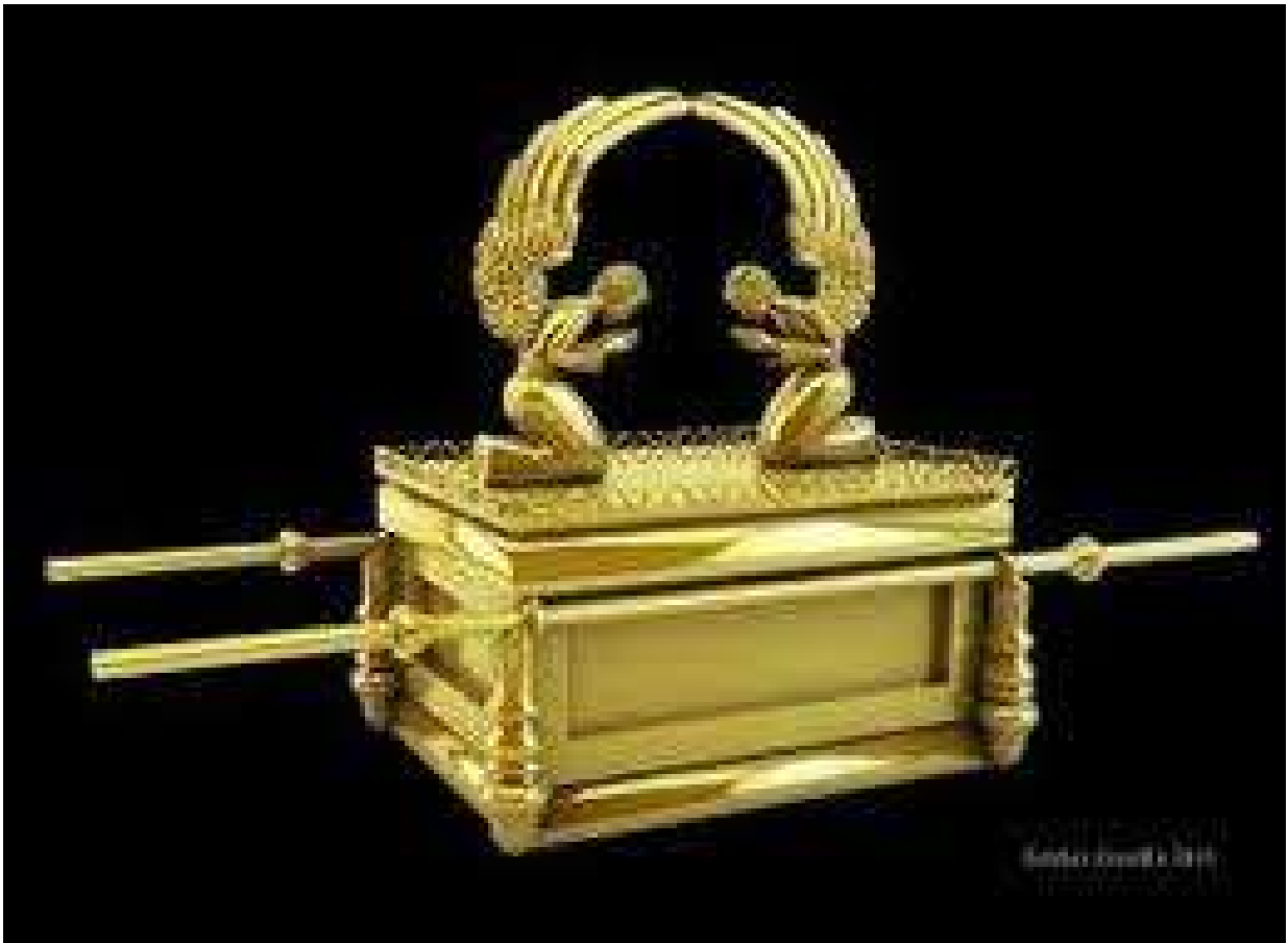
The Ark of the the Covenant

I YYAR-ZIW(ZIF) 1 KINGS 6:1 אֵיָרִי SECOND MONTH