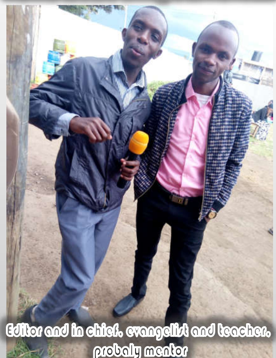
Editor and in chief, evangelist and teacher, probably mentor