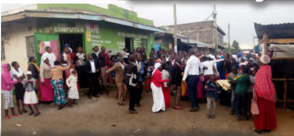
Singing Joyfully to Elohim...