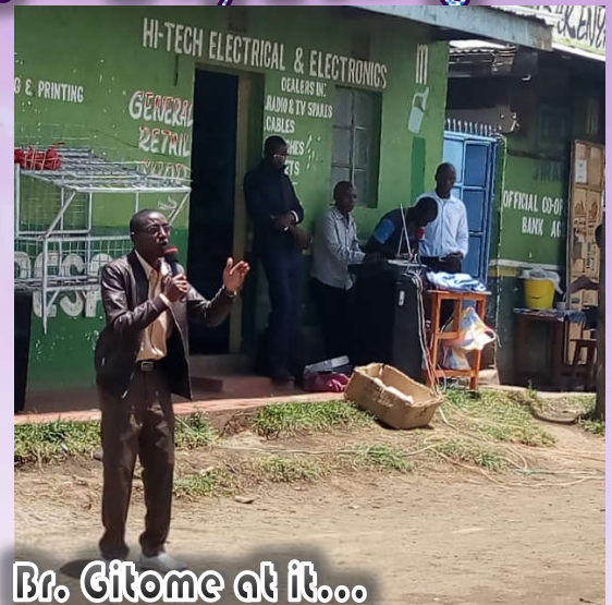
Br. Gtome at It...

The host made sure that everything needed for the open air