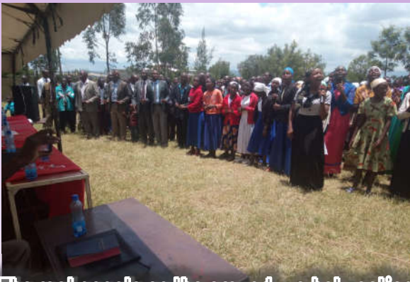
The real people on the ground...a holy nation