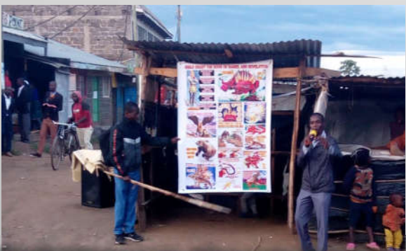
And of course, the prophecy...

evangelism, including and not limited to Instruments, was available in time. It was a big sacrifice bearing in mind, the host were students and hence had to input in Elohim's vineyard concurrently with their studies, the former superseding the latter at the time. The response from the audience was truly amazing. The aforementioned was proven by positive engagements from some of the message recipients who wanted the message to be expounded to them more. Personally, I had someone who approached me and bought a book to have some topics written therein for him. We also exchanged contacts with him for future engagements.