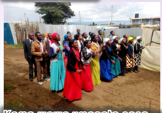
Kama wewe umepata neno...