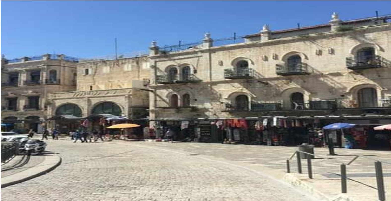
Jerusalem old city - Armenian..." and foreigners entered into his gates, and cast lots upon Jerusalem, even thou [wast] as one of them".Obadiah 1:11

ABIB (VIV) Esther 3:7, Ex 13:4, Deut 16:1 FIRST MONTH חַסְוֹן The Mount Zion Reporter P.O. BOX 568, Jerusalem, Israel IYYAR-ZIW (ZIF) 1 Kings 6:1 חֲזָרָה SECOND MONTH