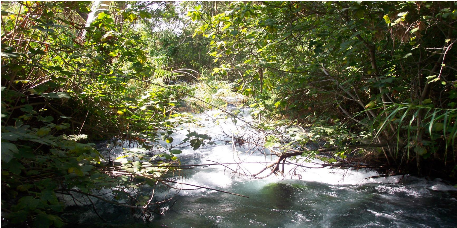
The Dan stream is the longest and most important of the three sources of the Jordan river.

ADAR Esther 3:7 TWELFTH MONTH אֲדָר ב' The Mount Zion Reporter P.O. BOX 568, Jerusalem, Israel ABIB (AVIV) Ether 3:7, Ex 13:4, Deut 16:1 גִּיּוֹס FIRST MONTH