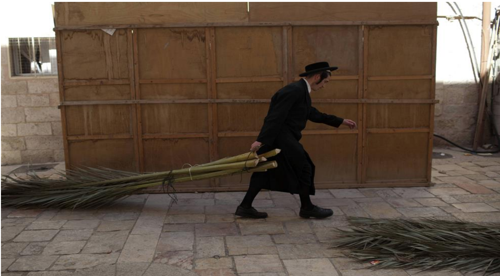
An Ultra –orthodox Jewish man drags Palm branches to be used for the celebration of Sukkot. Nehemiah 8:14-15

TISHRI-ETHANIM 1 Kings 8:2 SEVENTH MONTH תשרי The Mount Zion Reporter P.O. BOX 568, Jerusalem, Israel MARHESHWAN-BUL 1 Kings 6:38 שון EIGHTH MONTH