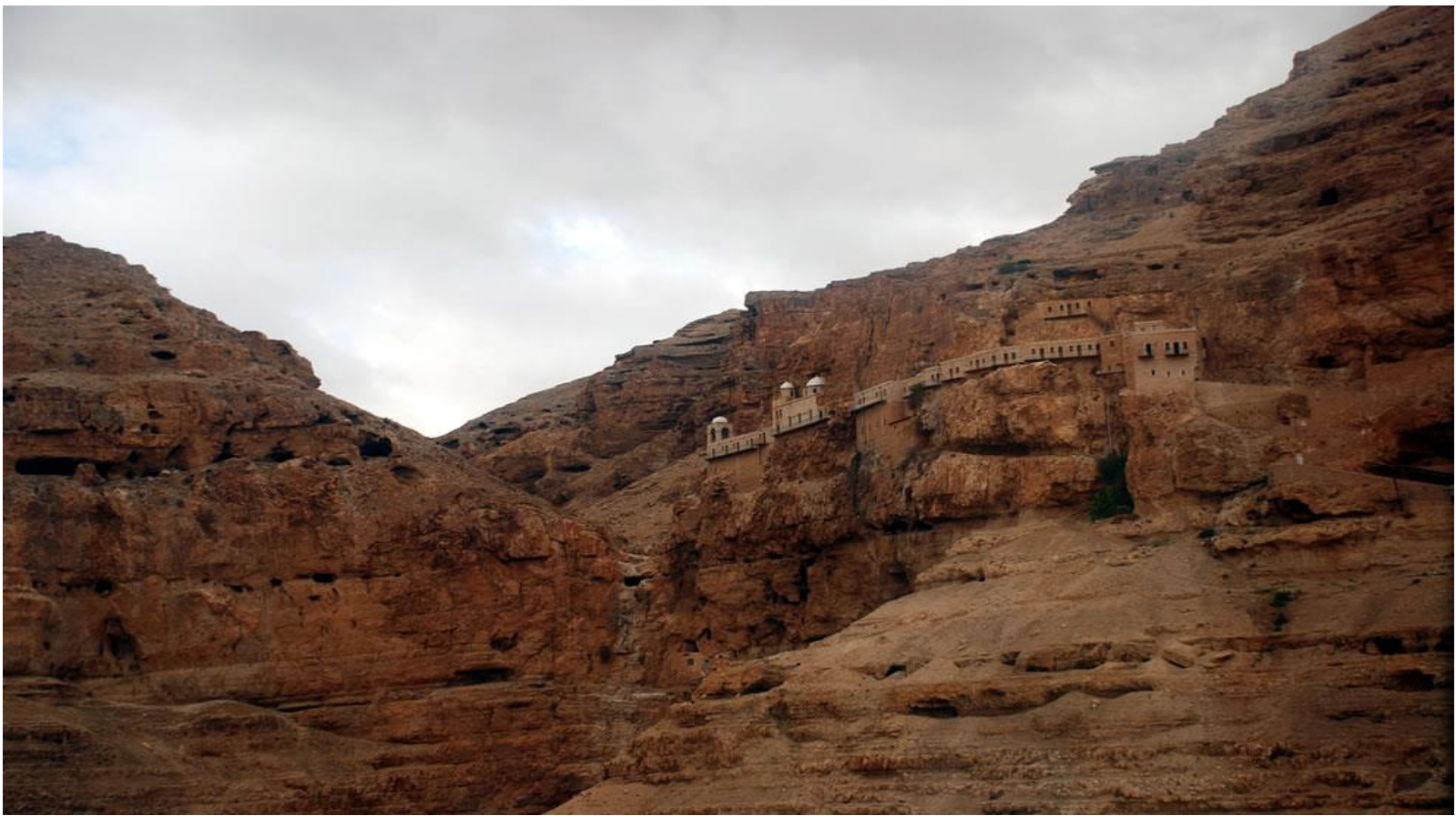
Mount of Temptation. This is the traditional locational of where Yahshua went during His time of temptation in the wilderness. Luke 4:1-13