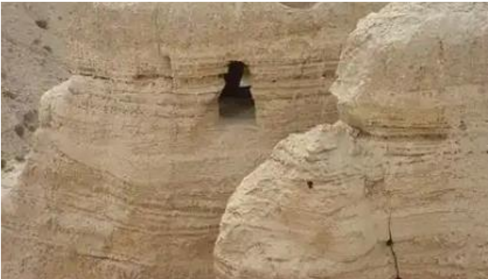
Qumran caves contained The original manuscripts of the Hebrew Bible.

MARHESHWAN-BUL 1 Kings 6:38 EIGHTH MONTH מְרִחְשָׁן The Mount Zion Reporter P.O. BOX 568, Jerusalem, Israel KISLEW (CHISLEU) Neh 1:1 כִּסְלֵו NINTH MONTH