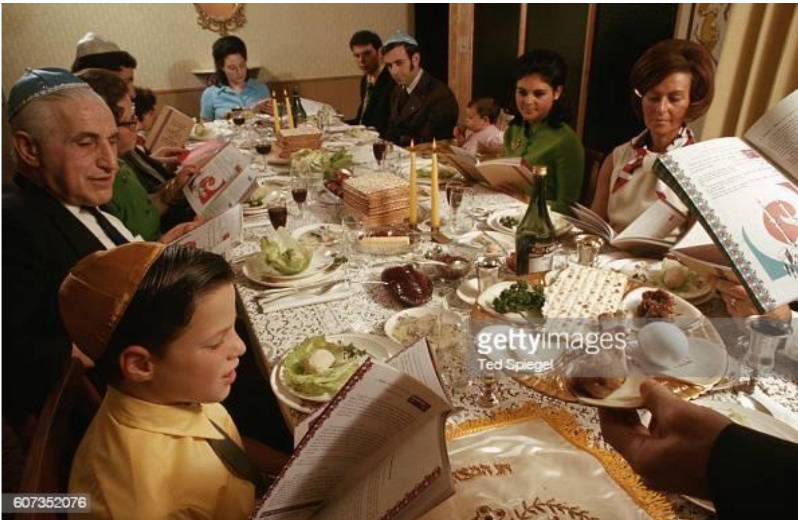
An orthodox Jewish family holds a Passover seder, commemorating the Jews’ escape from slavery in Egypt. Exodus 12:1-51.

TEVETH (TEBETH) Esther 2:16 TENTH MONTH טבת ..