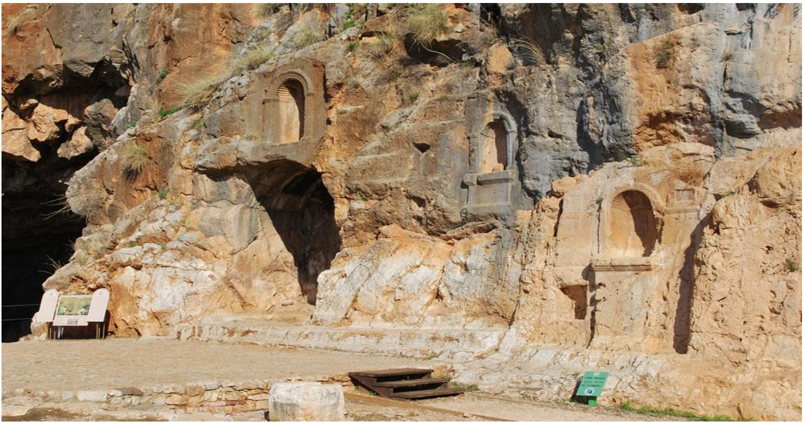
Banias, renamed Caesarea Phillipi after Herod Phillip, son of the Great. This the site of Peter’s confession -“Who do men say I am?” Mark 8:27-33; Luke 9:18.

TAMMUZ Zech. 8:19,Jer. 52:6 FOURTH MONTH תמוז The Mount Zion Reporter P.O. BOX 568 Jerusalem, Israel AV Jer 52:12 בֶּן חַמֵּשׁ חֹדֶשׁ