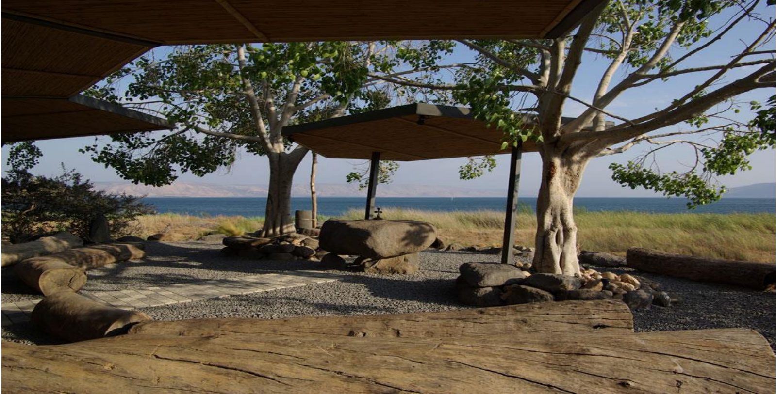
Tabgha, where it believed, Yahshua performed the miracle of feeding a multitude with five loaves and two fish. “Mark 6:38-41”.

ELUL Neh 6:1 SIXTH MONTH אלול The Mount Zion Reporter P.O. BOX 568, Jerusalem, Israel TISHRI-ETHANIM 1 Kings 8:2 תשרי SEVENTH MONTH