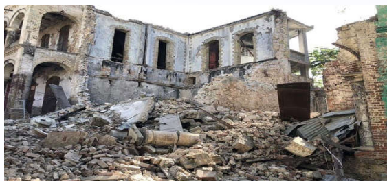
A damaged building in Haiti

On August 14 th 2021, a 7.2 magnitude earthquake struck the Tiburon Peninsula in the Caribbean nation of Haiti; it was the worst natural disaster of 2021. Damaging over 136,800 buildings and killing over 2,207 people as of 22 nd August 2021.