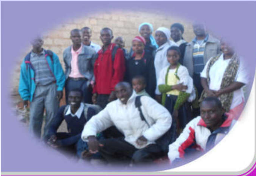
In a team, all are not Evangelists but all take part in a Mission. 1 Corinthians 12:5

same would suppress Elohim's directive. From human perspective the area seemed much heathen and hence conveying the message there, seemed challenging. Prior engaging NYASABA, which is located in Thika but in its interior [away from the town] we had engaged Thika town of which we had an amazing response. The setup was very different hence the feeling that we would face a lot of challenges in conveying the message.