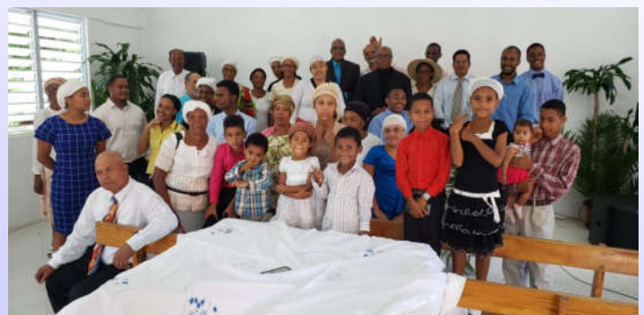
A congregation in one of the Caribbean Islands. Note the similarity and uniqueness in the mode of descent dressing.