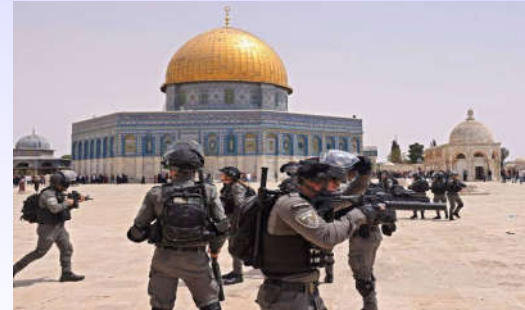
Israel forces at the Holy site

ago. It's every Jew wish that a day comes when another temple would stand on this same site. This clearly demonstrated that it's possibly for Israelis to recapture the holy site at some future date.