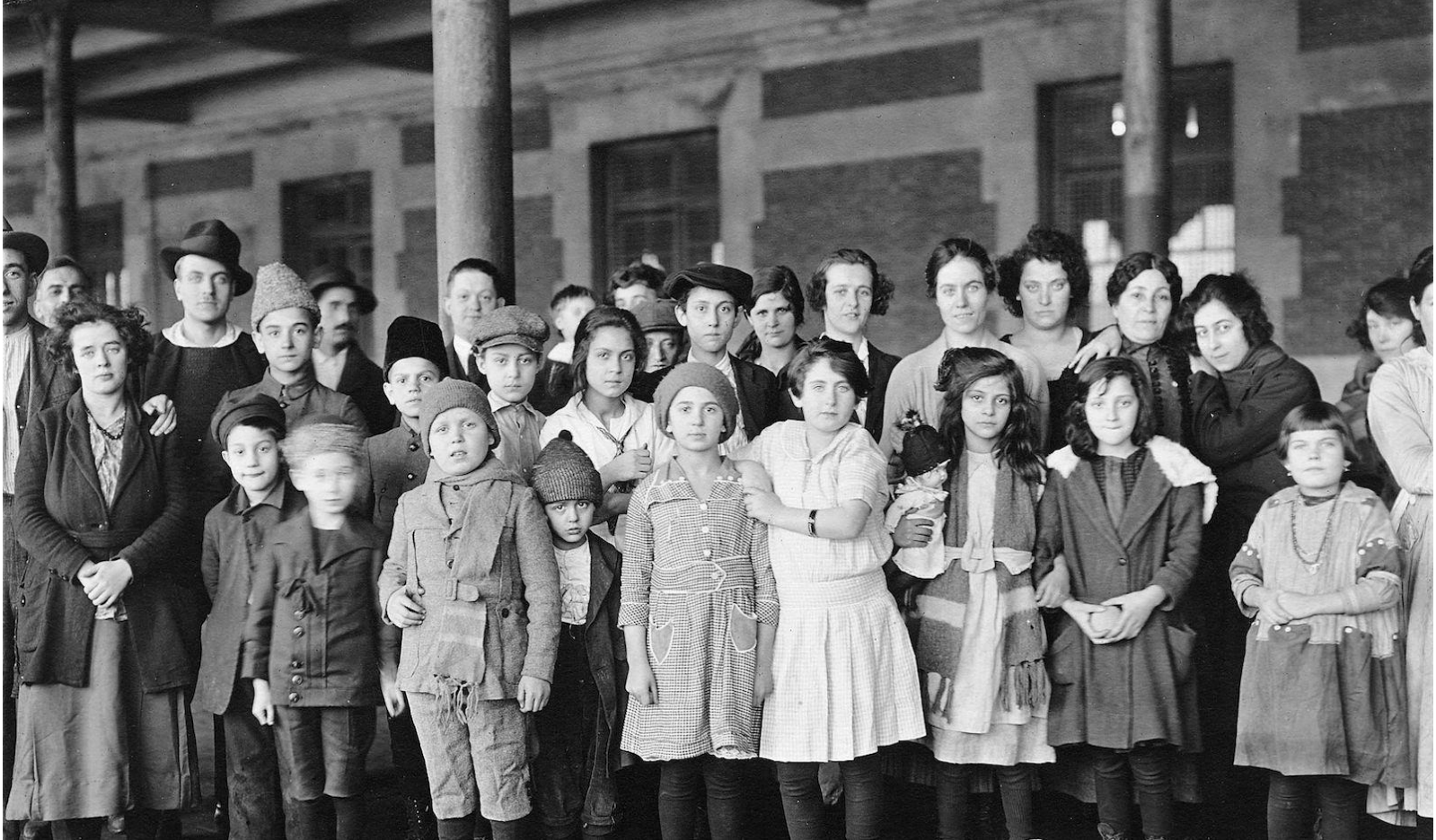
Arrival of immigrants in Israel, 1949. "For I will take you from among the heathen, and gather you out of all countries, and will bring you into your own land." Ezekiel 36:24.

ABIB (VIV) Esther 3:7, Ex 13:4, Deut 16:1 FIRST MONTH נִסָּן The Mount Zion Reporter P.O. BOX 568, Jerusalem, Israel IYYAR-ZIW (ZIF) 1 Kings 6:1 אֵיָר SECOND MONTH