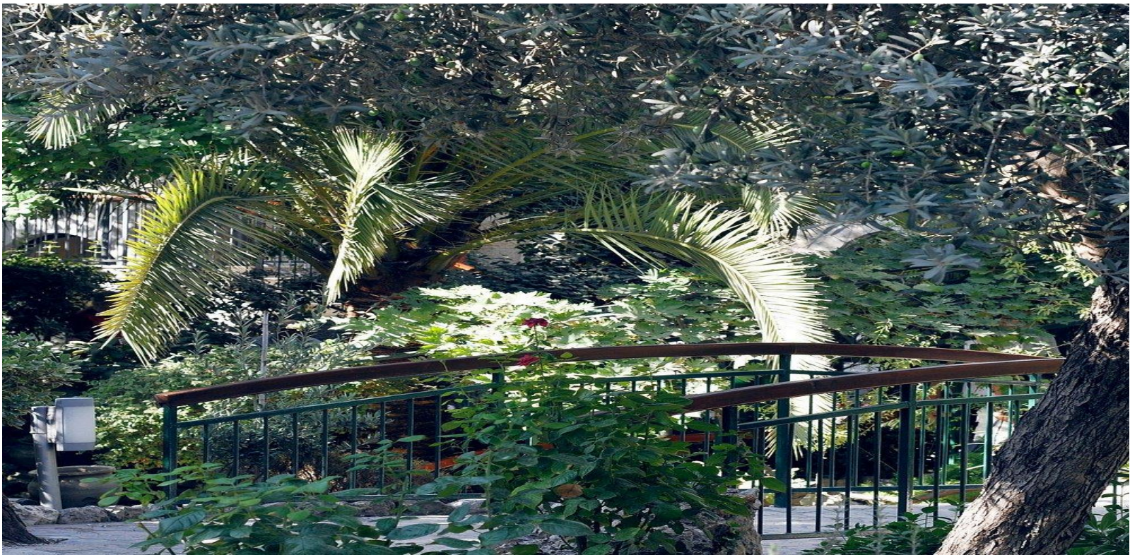
The garden tomb in Jerusalem that contains the tomb of Jesus.” And he took it down, and wrapped it in linen, and laid it in a sepulchre that was hewn in stone, wherein never man before was laid”. Luke 23:53.

ABIB (VIV) Esther 3:7, Ex 13:4, Deut 16:1 FIRST MONTH חֹדֶשׁ The Mount Zion Reporter P.O. BOX 568, Jerusalem, Israel IYYAR-ZIW (ZIF) 1 Kings 6:1 אִיָּאָר SECOND MONTH