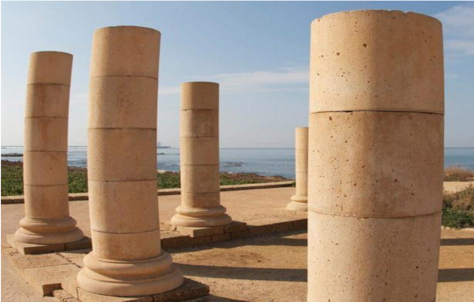
Pillars in Herod the Great Reef Palace complex, probably the site of Paul hearing and trial Act 25:1-26:32.

TAMMUZ Zech. 8:19,Jer. 52:6 FOURTH MONTH תמוז The Mount Zion Reporter P.O. BOX 568 Jerusalem, Israel AV Jer 52:12 אב FIFTH MONTH