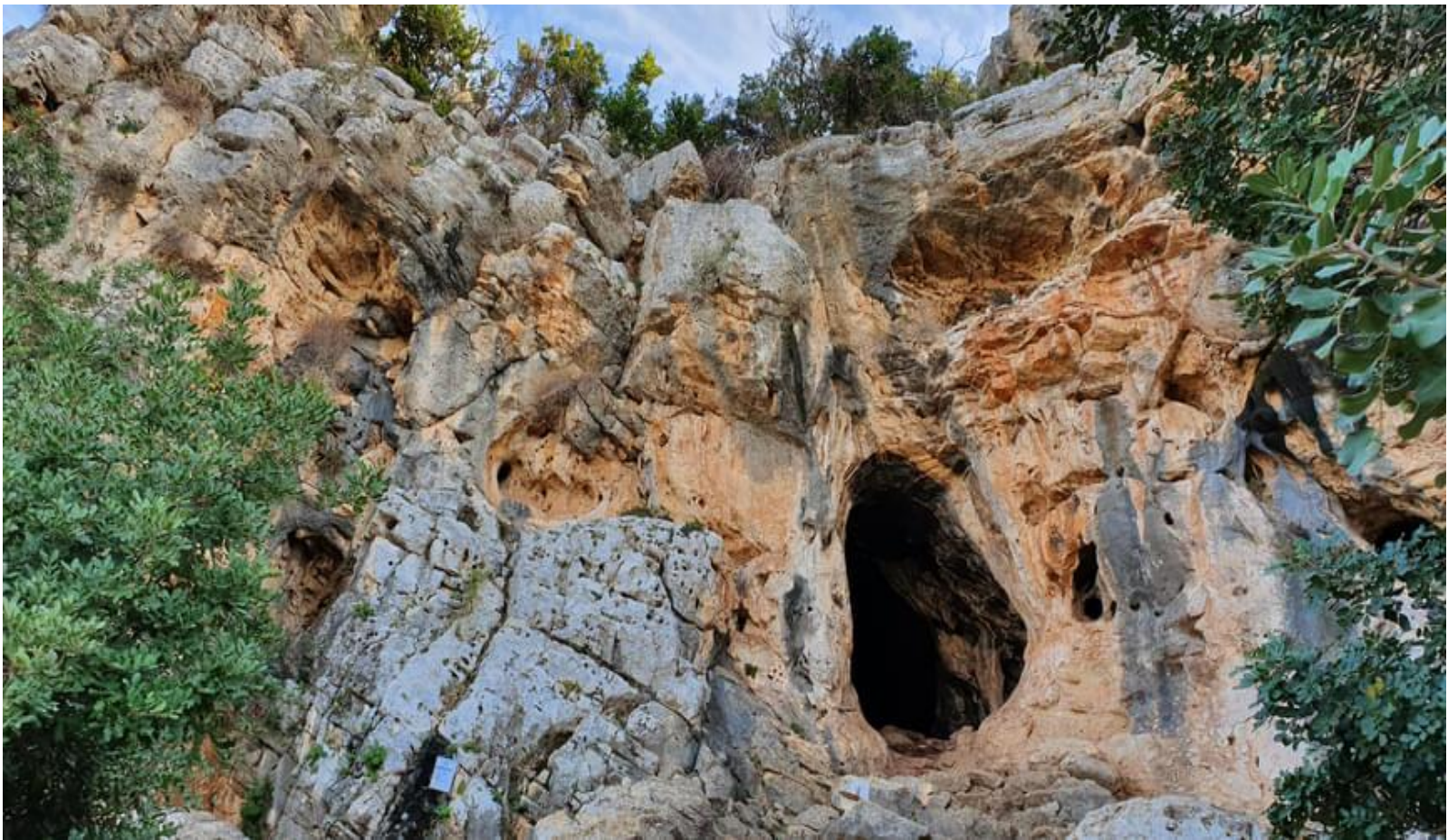
Cave of Elijah is place where Elijah took shelter from the wilderness. “And he came thither unto a cave, and lodged there; and, behold, the word of the LORD [came] to him, and he said unto him, What doest thou here, Elijah?”1King 19:9.

KISLEW (CHISLEU) Esther 2:16 TENTH MONTH טבת The Mount Zion Reporter P.O. BOX 568, Jerusalem, Israel SHEVAT Zech 1:7 שבט ELEVENTH MONTH